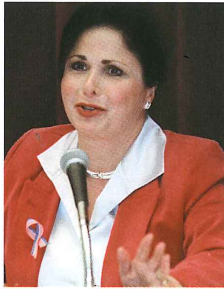
Rep. Gale D. Candaras '83