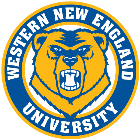
2-color (PMS 287 and PMS 130)