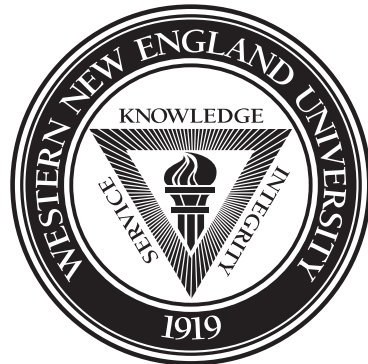
1-color (Black and White)