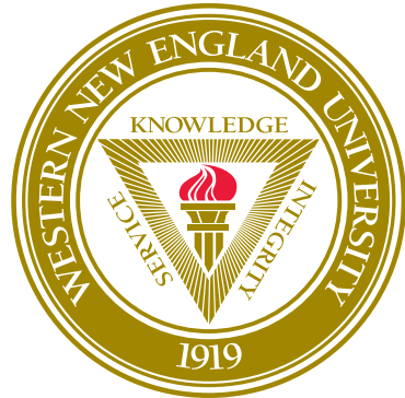
2-color (Gold and Red)