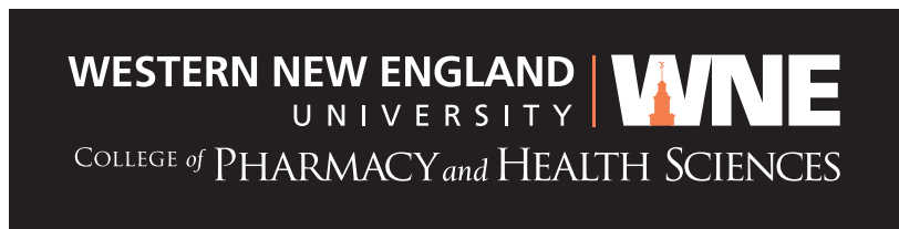
2-color (PMS Orange 021 and white)