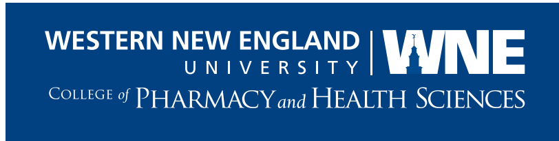
1 color (PMS 288)